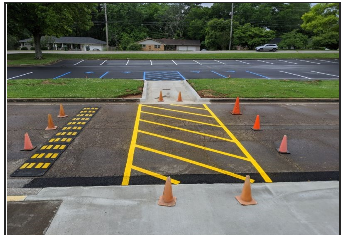
Striping is complete. Next we will be adding new parking and directional signs.